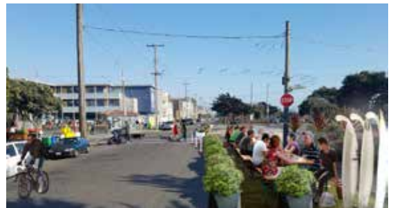
Conceptual Image of Phase 2